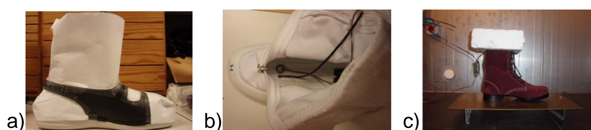
Figure 1. a) Footwear S with openings covered; b) Placement of the sensors (footwear H); c) Placement of the footwear (F) in a cold chamber. Figure 2 shows a typical cooling curve.

http://www.old.eat.lth.se/Research/Thermal/